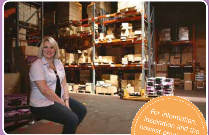
The Crafter's Companion warehouse

For information, inspiration and the newest products, go to www.crafterscompanion.co.uk