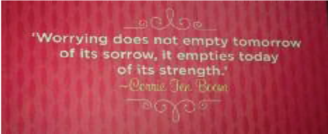
Inspiring quotes during one of the general sessions

and sharing techniques and inspiration.”