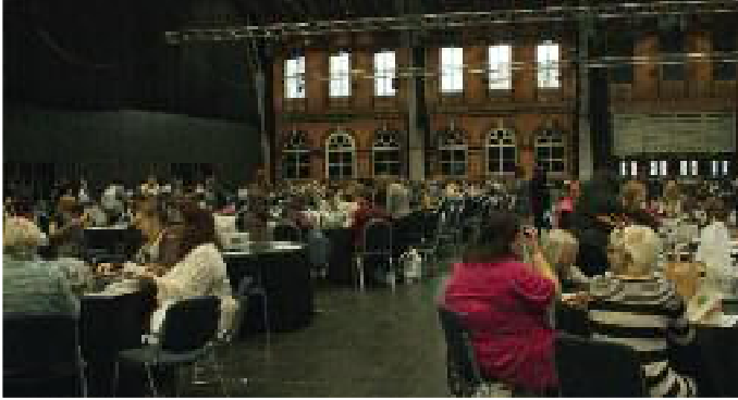
Demonstrators on a lunch break and crafting at the same time