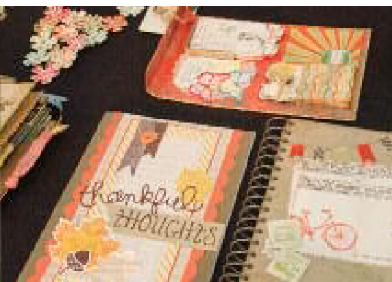
An inspiring project using the This and That collection

Turn the page for inspiration using the Stampin’ Up! Undefined Stamp Carving kit. For more information, or for the full range of products and card inspiration visit www.stampinup.com