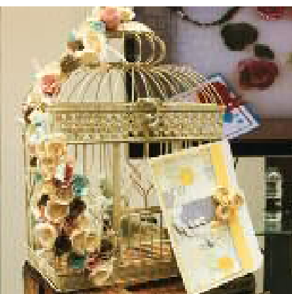
Project examples at the convention

"You can even see it with the swapping of cards", agrees Sara. "It's a way of sharing your hobby, getting recognition