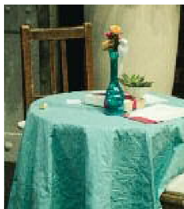
Table with project inspiration