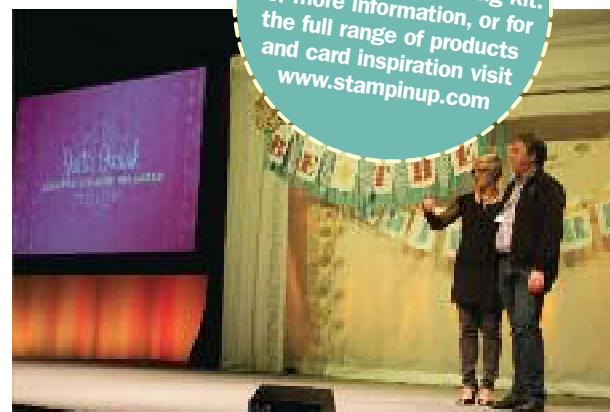
The winner of the Heart of Stampin’ Up! award during the closing ceremony