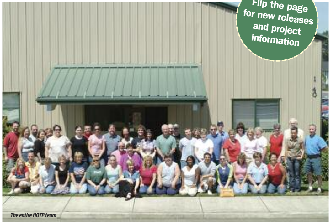
The entire HOTP team

Flip the page for new releases and project information