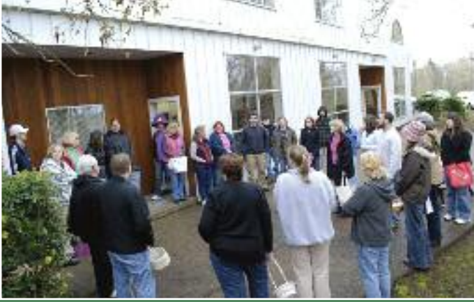
The yearly HOTP Easter egg hunt