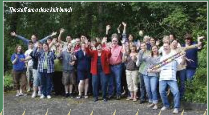
The staff are a close-knit bunch

Another big change for HOTP came in 2002. "We were originally a company that sold to other retailers and we noticed that in between it got filtered and not every retailer had everything in stock. Since