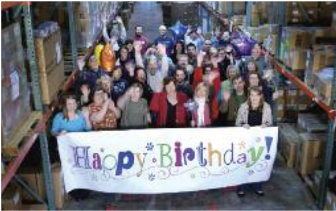
They celebrate the HOTP birthdays as well!

before the term scrapbooking was even invented. The book sold 50,000 copies in the first six months alone."