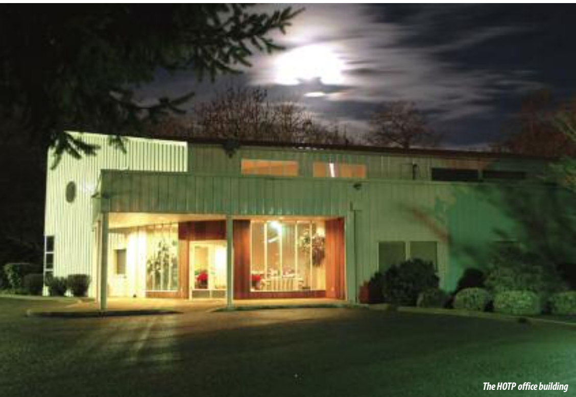
The HOTP office building

HOTP also started working with Fiskars. "The company wanted us to do a book on using its patterned-edged scissors. Around that time I went to one of those Creative Memories home parties and saw what they were doing using the scissors. We created the Snip Your Snapshots books