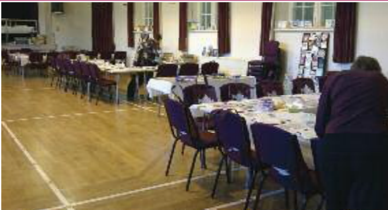
All set up for a day full of workshops