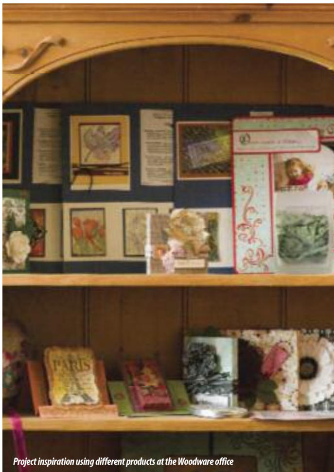
Project inspiration using different products at the Woodware office