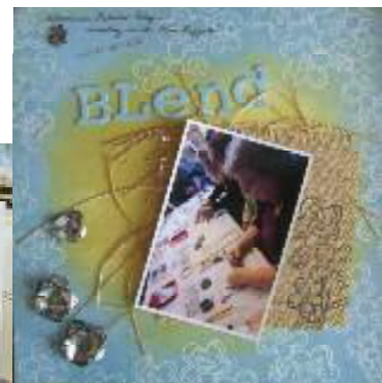
Examples of project inspiration as shown at the retailer's weekend