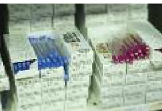
Stocks of pens

businesses and that's something we really like to advise people to do.”