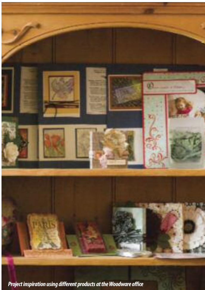
Project inspiration using different products at the Woodware office