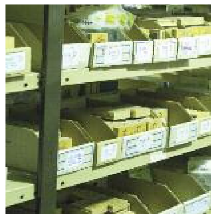
Woodware keeps its stock clear and neatly sorted