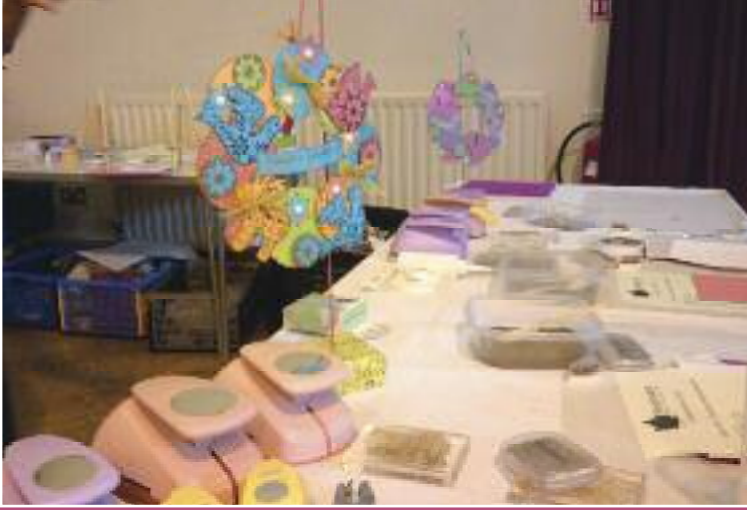
Project inspiration during one of the retailer's weekends