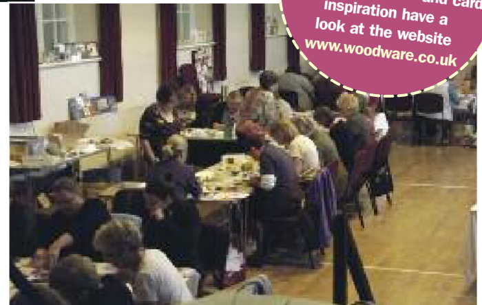
Workshops in full swing