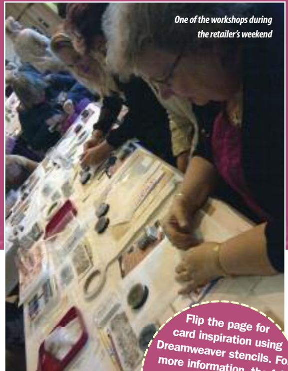
One of the workshops during the retailer's weekend

Flip the page for card inspiration using Dreamweaver stencils. For more information, the full range of products and card inspiration have a look at the website www.woodware.co.uk